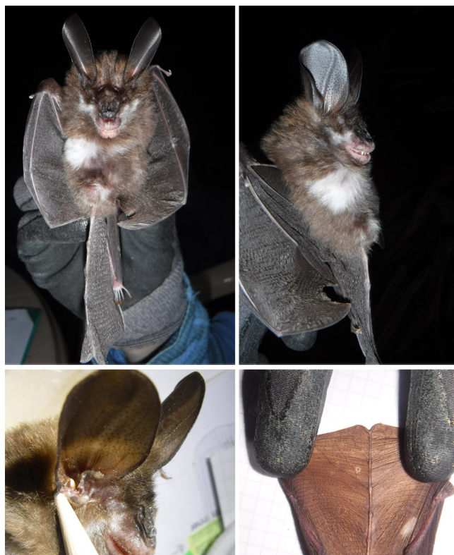
Fig. 2 - Frontal (top left) and profile (top right) picture of the piebald Nycteris arge . Bottom pictures show some diagnostic characters for this genus and species, tail ending in a T-shape (bottom right) and tragus (bottom left) respectively.

The chromatic disorder we observed in the bat was classified as a case of piebaldism, based on Lucati & López-Baucells (2017). Although piebaldism is a hereditary trait and we could not confirm its life history, we considered piebaldism as the most accurate term reflecting the condition observed. Our new record complements other available data in Central Africa, one of the least-studied regions of the