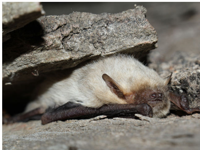
Fig. 2 Leucistic Pipistrellus pygmaeus : Natural refuges in the area with the leucistic individual (mimetic coloration).

As can be seen from the most recent published revision of albinism in bats (Uieda 2000), this type of amelanism occurs more frequently in Vespertilionidae than in other families, probably due to the fact that most effort in bat research has historically been carried out with this taxonomical group. Within the genus Pipistrellus , chromatic aberrations have been found in at least three different species: P. subflavus (albinism reported from Ohio, Bures 1948; leucism from Ohio, Goslin 1947; and melanism from Vermont, Osgood 1938), P. pipistrellus (Cervený 1977, Haensel 1972) and