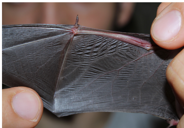
Fig. 4 Leucistic Pipistrellus pygmaeus : black, normally coloured wings with normal venation.

P. pygmaeus (albinism reported from Lodosa, Spain, Alcalde 2009).