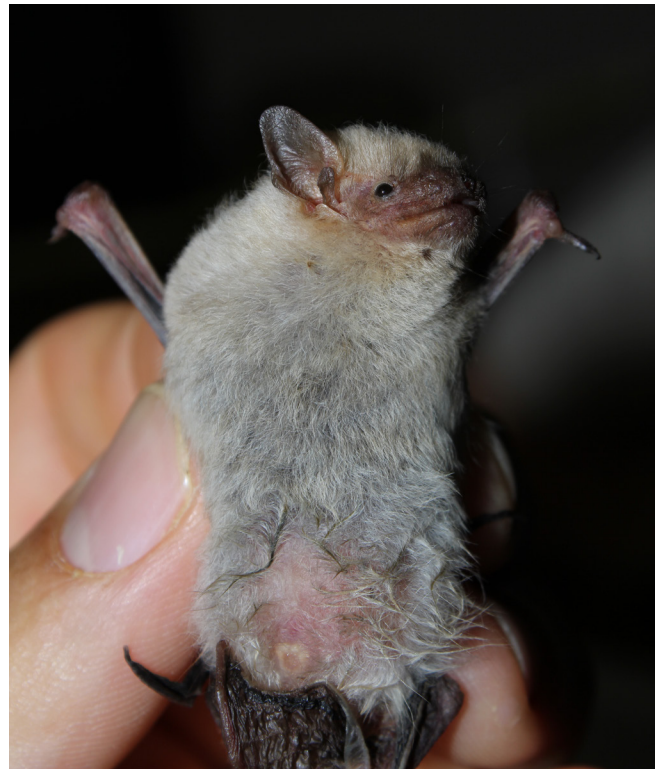
Fig. 1 Leucistic Pipistrellus pygmaeus : Whitish body colouration.

Bat research has been conducted in this area since 1999 (Flaquer et al 2005, Flaquer et al 2006)